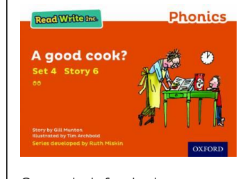
Orange book for developing reading skills with words that contain the sounds they have learnt.